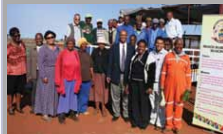
Above: The Retsanang Vegetable Co-operative members with the delegation who handed over the trailer.