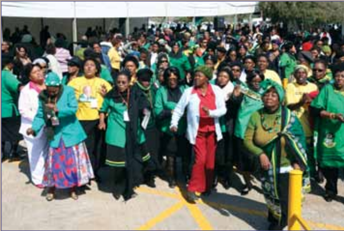
Women of all ages reacted with joy when the statue was revealed.