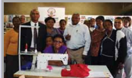
Some of the ladies from the Zwavhudi Project with the delegation who handed over the sewing equipment.