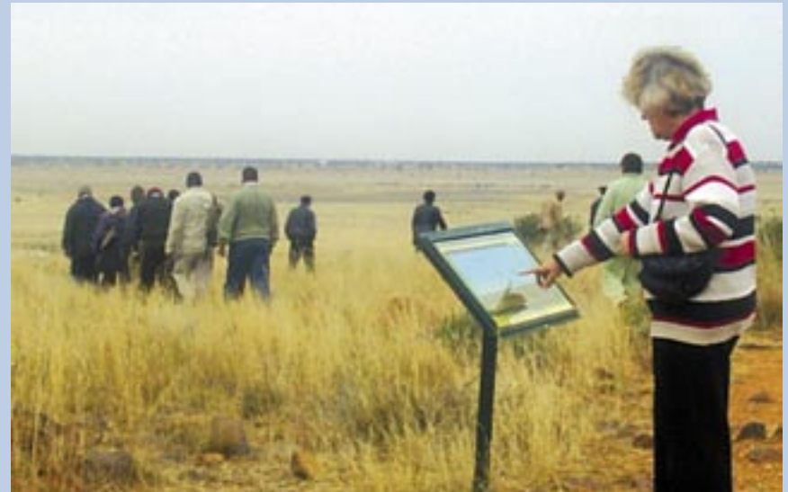
↑A tourguide took Councillors on a walk up the kopje at Wildebeestkuil for a look at the Khoisan drawings and to tell them a bit more about the Khoisan traditions.