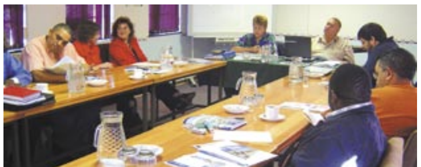
Staff members of the Levy Section of the FBDM, Eden District Municipality (George) and Northern Free State District Municipality (Sasolburg).

FSO IT Services, the supplier of the system, facilitates the workshops.