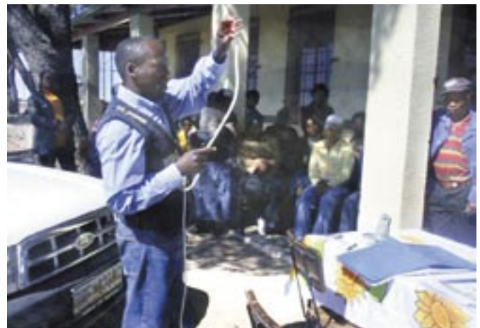
Electricity Safety Campaign - Eskom official doing a demonstration on the safe use of electricity ▲

The FBDM is currently busy with an electrification project in Koopmansfontein for 37 households. Electricity safety awareness forms part of the whole package. The Community Development Unit of the FBDM together with Eskom's Public Safety Unit embarked on a safety campaign whereby the community of Koopmansfontein was engaged in an educational programme regarding safety. Demonstrations were done and public participation encouraged through question and answer sessions and prizes ranging from squeeze bottle's, t-shirts and Eskom's promotional items were distributed.