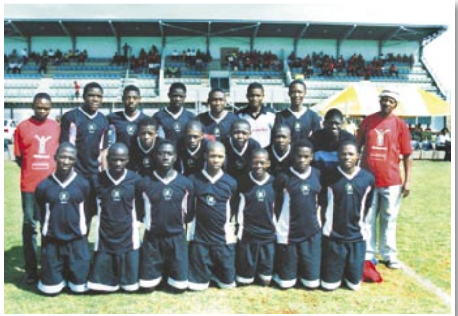
The winning team: Boys High School

Local food stall owners in Galeshewe sold their products at the stadium