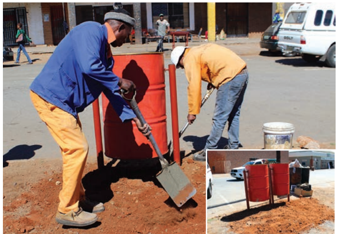
The teams installed dustbins in the CBD area of Warrenton (above) and cleaned the streets (below).