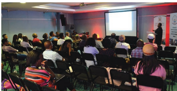
Below: Inside one of the master classes presented by industry experts.