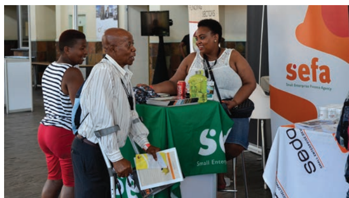
Above: Small business owners had the opportunity to engage with sponsors and exhibitors.

“The goal is to give more than 300 entrepreneurs and small business owners the opportunity to build the skills and relationships they need to achieve business success, and sustainable growth.”