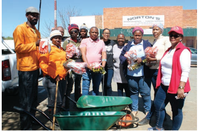
The Mayor of Magareng Local Municipality and the rest of the delegation handed over equipment that will be used by the cleaning team.

The cleaning targeted areas within town where there is a large influx of locals, small businesses and tourists. NGOs were invited to work together with the local municipalities on the clean-up and also to create environmental awareness amongst local communities.