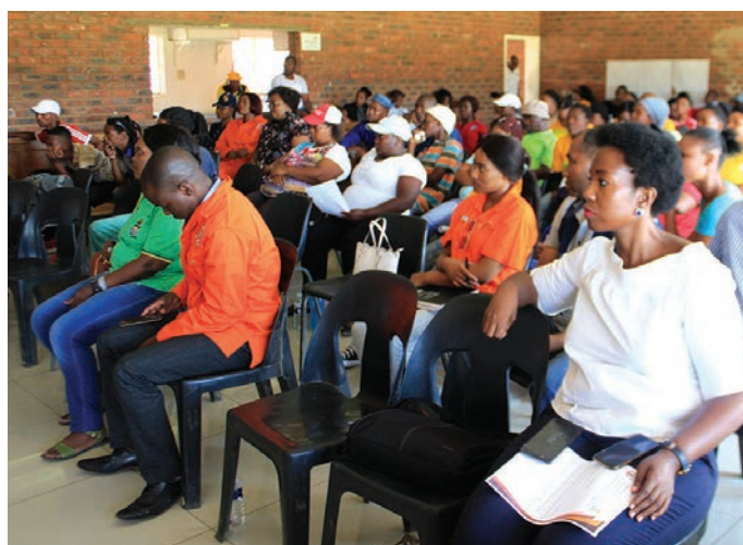
Below: Members of the team who will be signing contracts with the local municipality and officials from the National Department Of Public Works, district municipality and local municipality who attended the launch event.