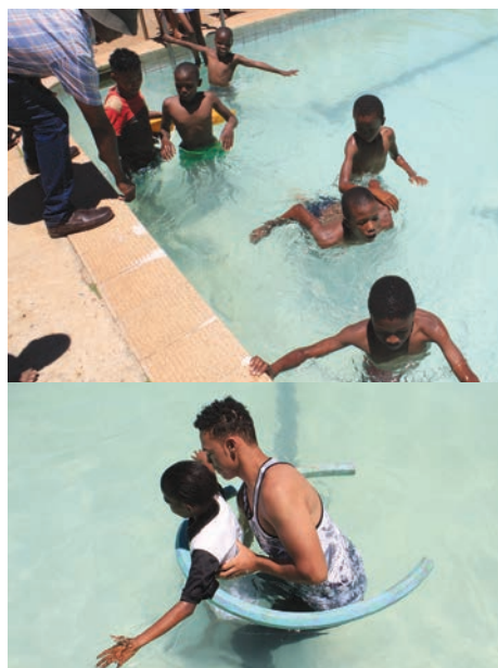
Left: One of the two life guards at the Transka Resort took some of the children into the pool and showed them the basics about swimming. Just the basics may save their lives and the lives of their friends.