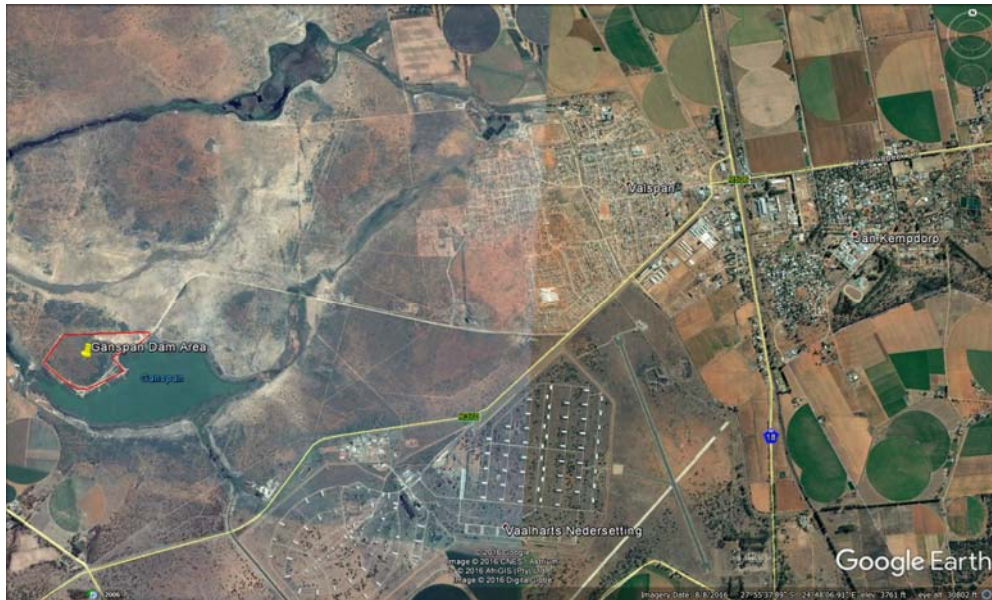
(Figure 2: Locality Map)