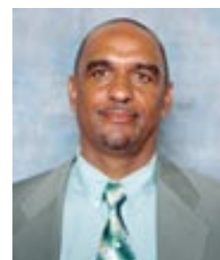
The Executive Mayor, Mr Achmat Florence

I encourage the public to engage in the activities of the district municipality and to play an active role. This will not only ensure that you as the community stay abreast on current issues but will establish that much needed network of communication that is of vital importance if we are to succeed as a collective in achieving our mandate.