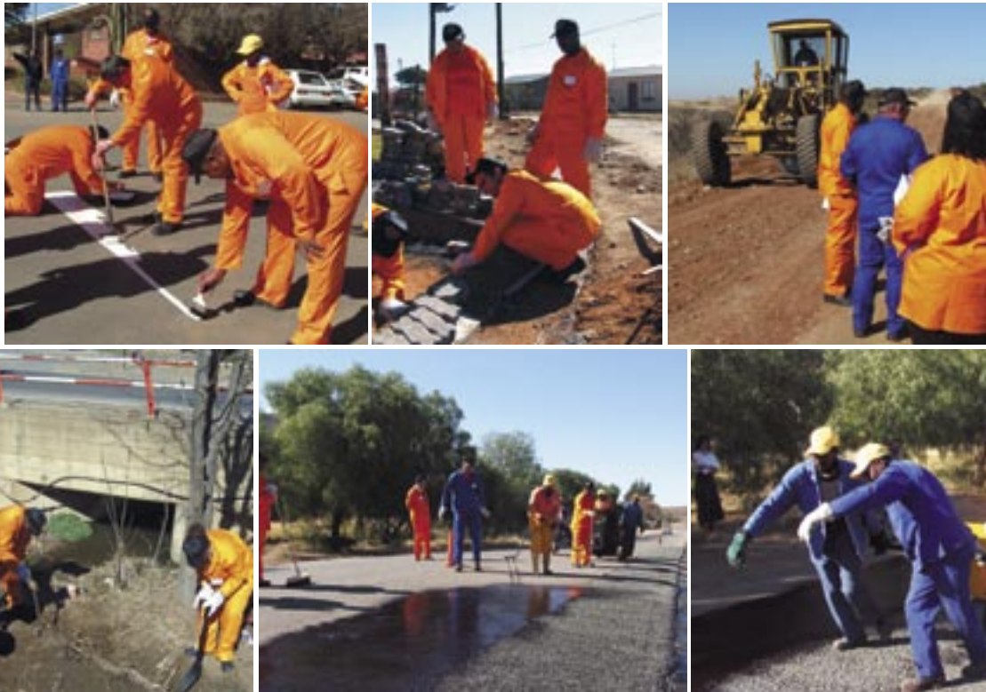
Participants were grouped into teams, each with a specific practical assignment, viz. laying a brick pavement, cleaning stormwater drains, resurfacing roads, fixing potholes and even erecting a stop sign (and painting STOP neatly on the street).

THE ROADS, STREETS & STORMWATER SEMINAR 11–12 JULY 2006