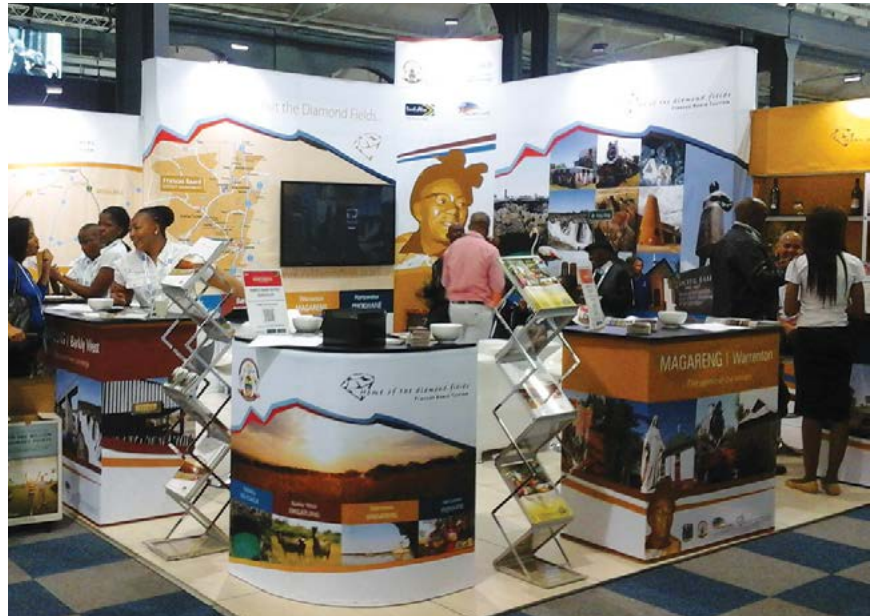
The Frances Baard District stand at Indaba 2015.

The well-known Vaalharts Irrigation Scheme, the Olives South Africa as well as the Hartswater Wine Cellars are located in the Phokwane area.