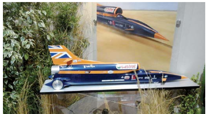
A replica of the Bloodhound on display on the NCTA stand. Visitors to the stand could also test a simulation driving experience.