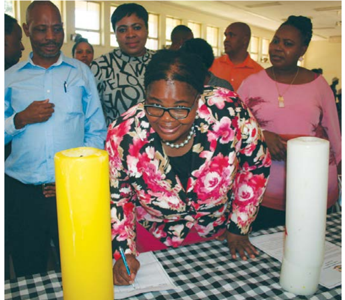
Executive Mayor, Cllr. Khadi Moloi, signs the pledge to recommit to the fight against the HIV/Aids epidemic.