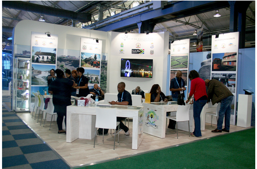
The Frances Baard District stand at Indaba 2016.