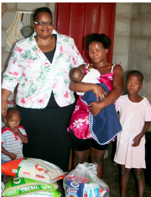
The executive mayor handed out food parcels to needy families in Delporthoop during the programme.

“Indeed the challenges of our people are appalling. In many households the grandmother’s pension grant is the only means of income and survival for the family,” she concluded.