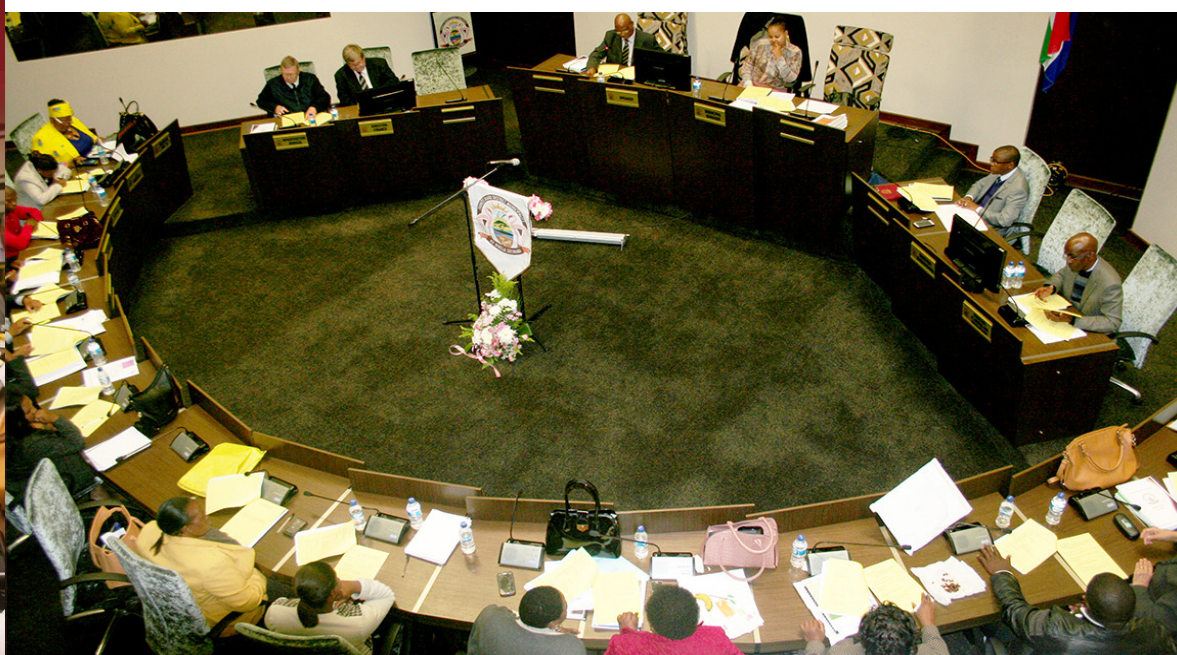
Council in sitting during the budget speech on 25 May 2016 to adopt the 2016/17 financial year budget. Read more on PAGE 3