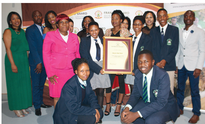
Overall winner - business tourism category (Grade 12): Degania High School