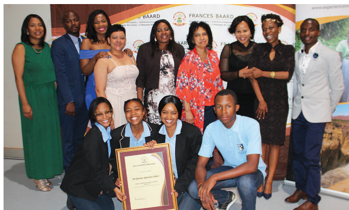
Overall winner - tourism category (Grade 11): St Cyprians Grammar School