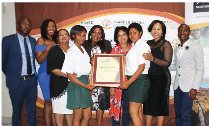
Overall winner - tourism category (Grade 10): William Pescod High School