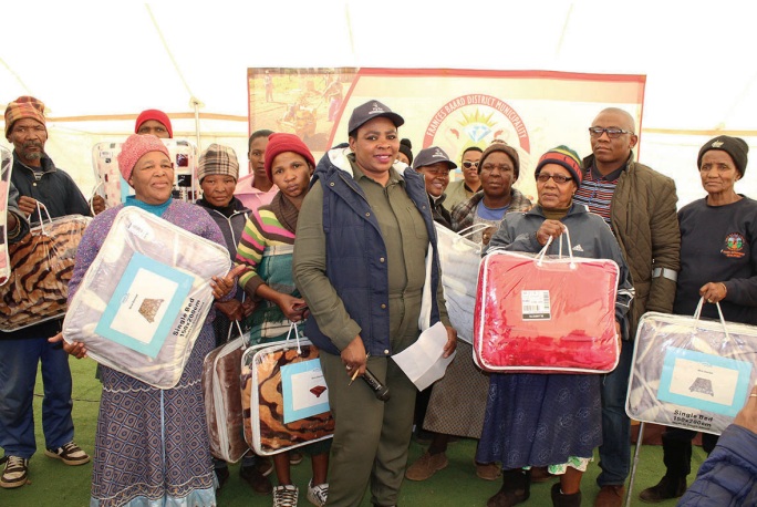
The delegation joined a group of elderly people in Ikhutseng at a special event to honour them. The senior citizens were put through their paces with an aerobics class before the main programme started. The two mayors then handed out blankets to approximately 110 elderly people.