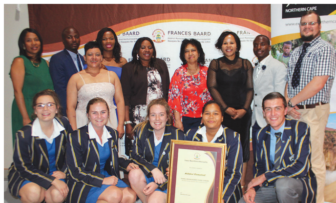
Overall winner - business studies category (Grade 12): Hoërskool Diamantveld