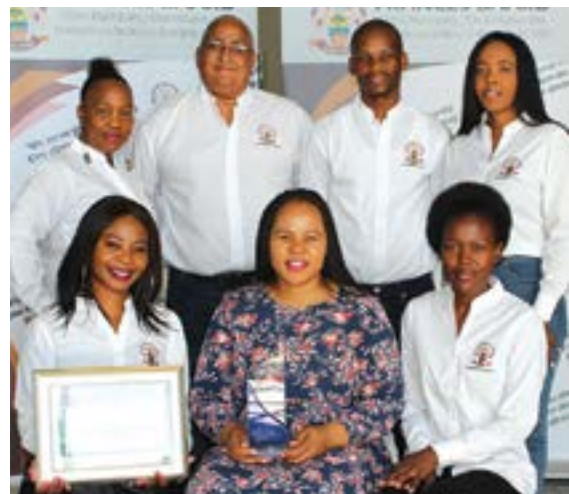
Above: The Environmental Health team with the Director Administration and the Municipal Manager (seated left and middle), with the awards for the best improved district municipality.