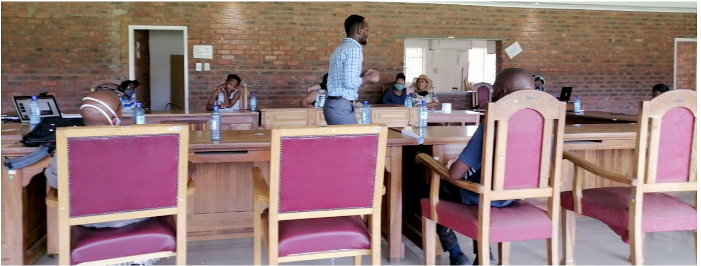
Above: A facilitator leads the discussions during the session in Barkly West on 18 November 2020.