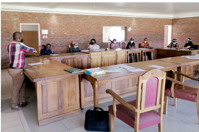
Below: The session took place at the municipal offices in Barkly West.