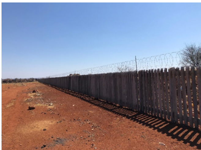
Above: The landfill site in Warrenton with its completed fence.

is of importance to protect the site against vandalism. There were also concerns about the size of the landfill and there were indications that there will be a need for an extension in future.