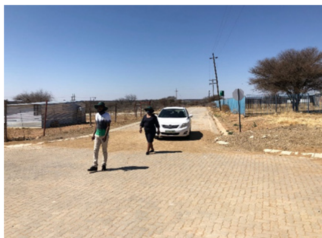
Above: The completed paved roads in Stillwater.

This project is 97% complete. Outstanding items includes the installation of culverts by the contractor, thereafter the snag list 1 can be finalised. The paving has been completed on all roads. The project experienced several hick-ups and was running behind schedule from its original completion date in September 2019. The contractor was granted continued extensions with penalties over a period of four months. Extenuating circumstances which added to the delays was the implementation of the National Lockdown in March 2020. The local municipality then extended the project to end of August 2020.