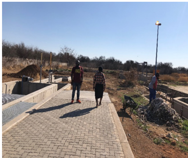
Above: The committee inspect the upgrades at the wastewater treatment works.

The wastewater treatment works in Hartswater is undergoing an upgrade and it is set to be completed at the end of November 2020. There were concerns raised about the vandalism taking place around Phokwane's infrastructure.