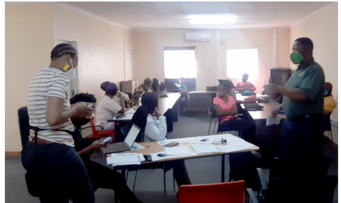
Above: The information session in the Phokwane municipality took place at the Business Support Centre.