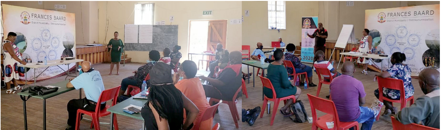
Above: A facilitator leads the discussions during the session in Phokwane local municipality on 19 November 2020.