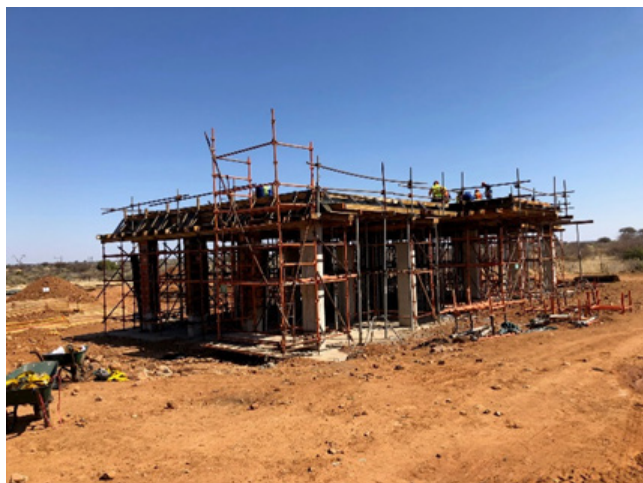
Above: The landfill site in Barkly West needs a fence.

The water treatment works is under construction and the project is currently at 20% completion. The civil works contractor was on site at the time of the visit and they were busy with steel fixing and casting of concrete.