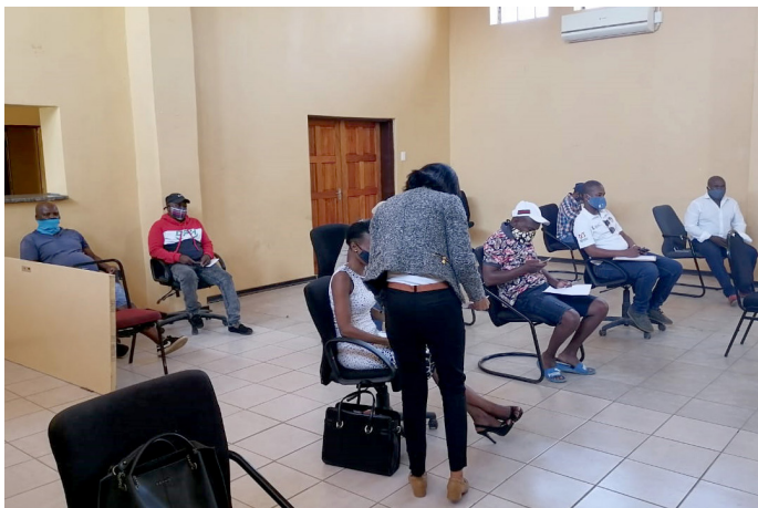
Above: The information session in the Dikgatlong municipal area took place in Delportshoop.