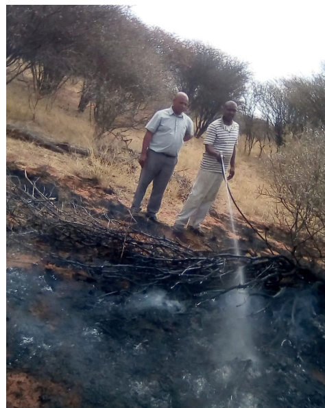
Left: The Disaster Management team of the FBDM assisted with the veld fire that broke out in the Magareng municipal area on 18 October 2020. The fire started in the Spitskop Dam area and spread rapidly because of the strong wind.

The National Forest and Veldfires Act (Act 101 of 1998), put the responsibilities on all landowners to safeguard their properties; therefore, landowners are forced to establish Fire Prevention Association (FPA) within their area of jurisdiction. The Fire Protection Association must include all the inhabitants of farms as well as communities within the area of the FPA.