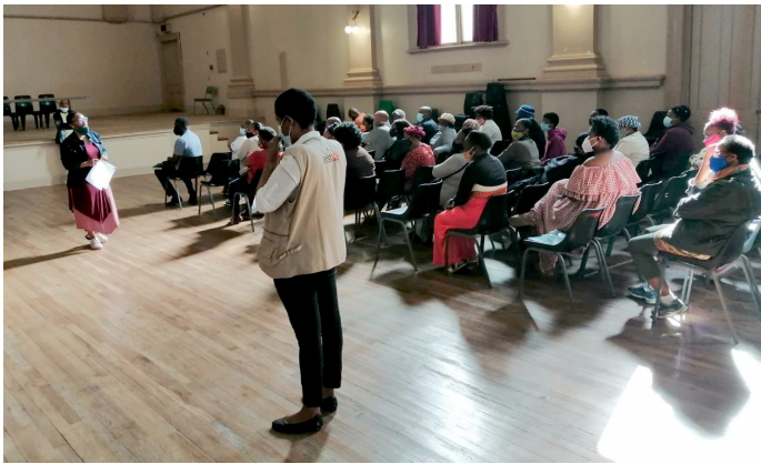
Above: The information session in the Sol Plaatje municipality took place at the City Hall in Kimberley.

Two task teams consisting of the DSDB, SEDA and LED officers from the local municipalities and the district municipality held information sessions on 23 September 2020 in different venues in the district. During the sessions interested stakeholders was assisted with either completion of application forms or sharing of information.