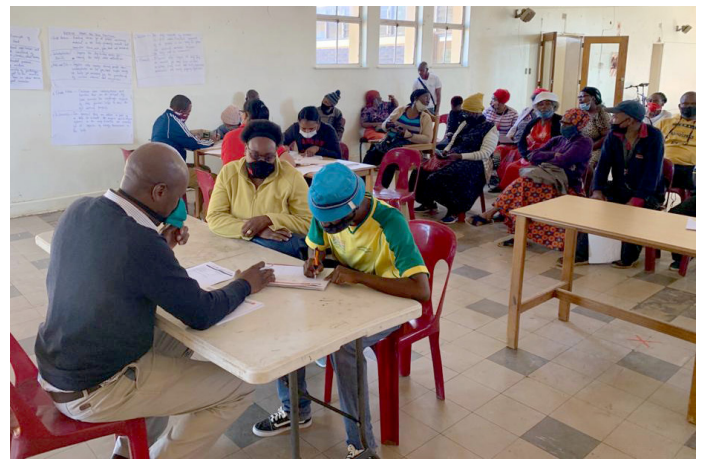
Above: The information session in the Magareng municipality took place at the Community Hall in Warrenton.

“The overall impression is that there are many SMMEs in the Frances Baard District that possess great potential for growth and success and the levels of poverty especially in the rural communities can be significantly condensed with the continued support offered by all stakeholders involved in the Township and Rural Entrepreneurship Programme (TREP). Many of our entrepreneurs should be nurtured and given the required funding.”