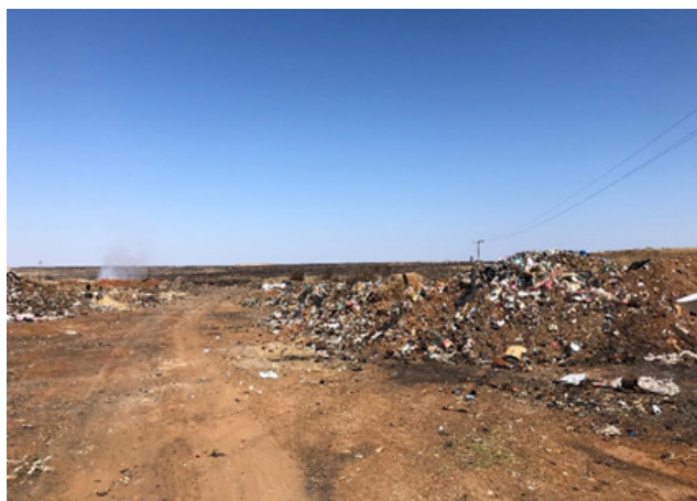
Above: The landfill site in Barkly West needs a fence.

The committee was satisfied with the progress that has been made at the landfill site. Since the last oversight visit, the landfill site has been graded and cleaned and it is important that a fence be erected for security, access control and to keep the waste within the landfill site.