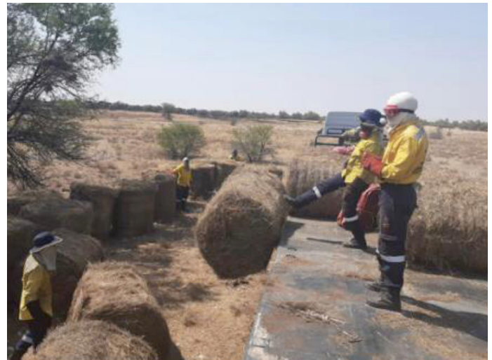
Above: Working on-fire teams at work.