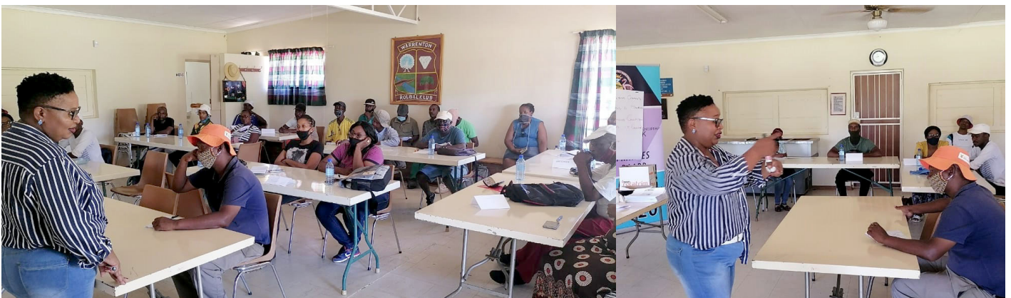
Above: A facilitator leads the discussions during the session in Magareng local municipality on 20 November 2020.