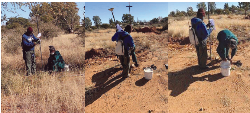
Above: Pegging of stands on Farm Guldenskat portion 36 of portion 42 in Jan Kempdorp as part of the Phokwane infill development process.

The project implementation has been delayed due to the National Lockdown. Only phase one to phase three have been completed. The project has been rolled over to the 2020/2021.