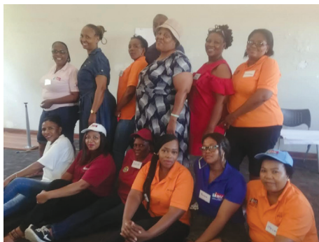
Above: Participants who attended the training on the fundamentals of project management

The woman empowerment programme was a partnership with the Department of Economic Development and Tourism and SAWIC. The intention was to support SAWIC so that they train their members on project management. FBDM signed an MOU with SAWIC to formalise the relation and transferred R50 000 to SAWIC to undertake the training. The training took place on 17 - 21 February 2020 in Hartswater and the module was fundamentals of project management. Due to the lockdown in March 2020 businesses could not be visited to assess the impact of the training.