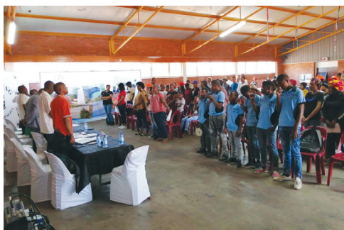
Above: Tourism awareness programme in Warrenvale, Warrenton

Frances Baard District Municipality together with our four local municipalities (Magareng, Dikgatlong, Sol Plaatje and Phokwane) hosted the annual Tourism Awareness Campaign during the month September in the Magareng and Dikgatlong Local Municipalities. Local communities and product owners' involvement has always been the corner stone of every Tourism Awareness Campaign we have hosted in the district over the years and it was no different for the 2019 programme. Awareness events took place as follows: